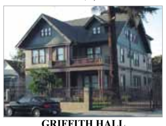
Shared Apts - $850/month/room