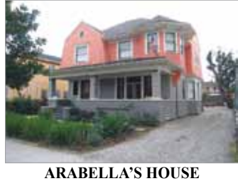
6 Bedrooms - $5.500/month