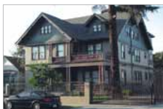
GRIFFITH HALL Shared Apts - $875/room/month