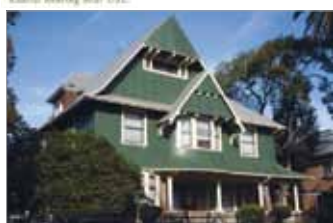
WOODCRAFT MANOR 9 Bedrooms - $8,000/month