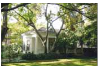
THE COLONEL'S COTTAGE 1 Bedroom Cottage - $1,500/month

LARGE ROOMS, FREE PARKING, WEEKLY HOUSEKEEPING NOW SHOWING FOR AUGUST 2015 (213) 663-3023 - www.RobinsonResidences.com (2-19)