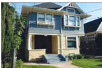
WESTON HOUSE Graduates Only - $900/month

LARGE ROOMS, FREE PARKING, WEEKLY HOUSEKEEPING NOW SHOWING FOR AUGUST 2015