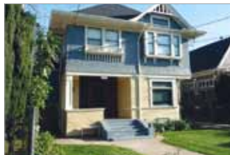
WESTON HOUSE Graduates Only - $900/month

LARGE ROOMS, FREE PARKING, WEEKLY HOUSEKEEPING NOW SHOWING FOR AUGUST 2015