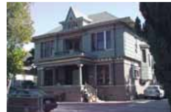
MONTGOMERY HOUSE 6 Bedrooms - $5,500/mo.