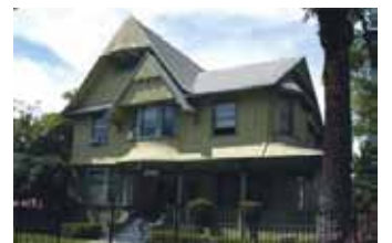
WOODCRAFT MANOR 9 Bedrooms - $7,500/mo.

SEE OUR WEBSITE FOR DETAILS, PHOTOS www.robinsonresidences.com (213) 663-3022 (4-5)