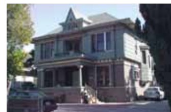
MONTGOMERY HOUSE 6 Bedrooms - $5,500/mo.