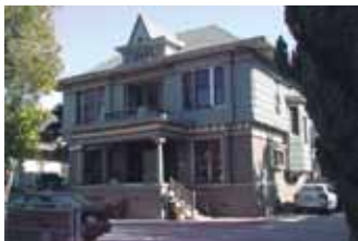
MONTGOMERY HOUSE 6 Bedrooms - $5,500/mo.

THE FINEST HOUSES IN UNIVERSITY PARK EXCELLENT PARKING WALK, BIKE TO USC