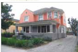
ARABELLA'S HOUSE 6 Bedrooms - $5,500/month