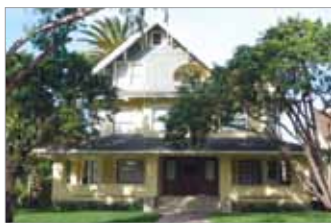
WALLACE HOUSE 6 Bedrooms - $5,000/month