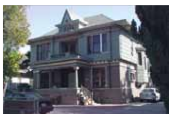
MONTGOMERY HOUSE 7 Bedrooms - $5,500/month