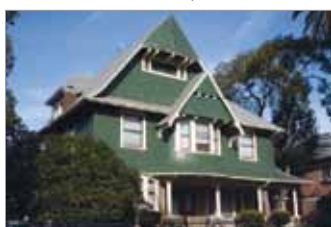
WOODCRAFT MANOR 9 Bedrooms - $7,500/month

LARGE ROOMS, FREE PARKING, WEEKLY HOUSEKEEPING AND THE LOWEST CRIME RATE WITHIN WALKING DISTANCE OF USC