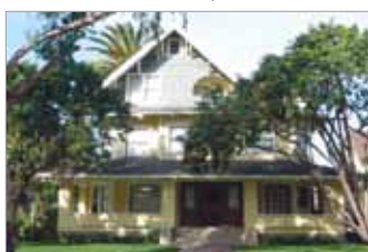
WALLACE HOUSE 6 Bedrooms - $5,000/month