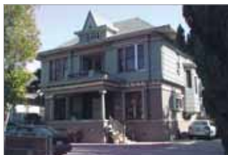
MONTGOMERY HOUSE 7 Bedrooms - $5,500/month