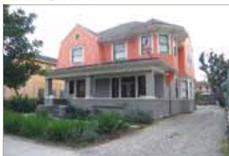
ARABELLA'S HOUSE 6 Bedrooms - $5,500/month