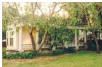
THE COLONEL'S COTTAGE 1 Bdrm Cottage - $1,500/month