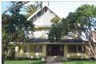
WALLACE HOUSE 3 Bdrm Apt - $2,500/month