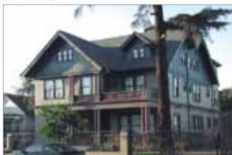
GRIFFITH HALL Shared Apts - $850/month/room