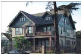
GRIFFITH HALL Shared Apts - $850/month/room GRADUATE STUDENTS!