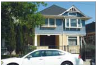
WESTON HOUSE Rooms - $850-$875/month

We've just acquired Weston House (shown left) at 2112 Portland Street, 6 blocks north of campus and 1/2 block from USC Tram A.