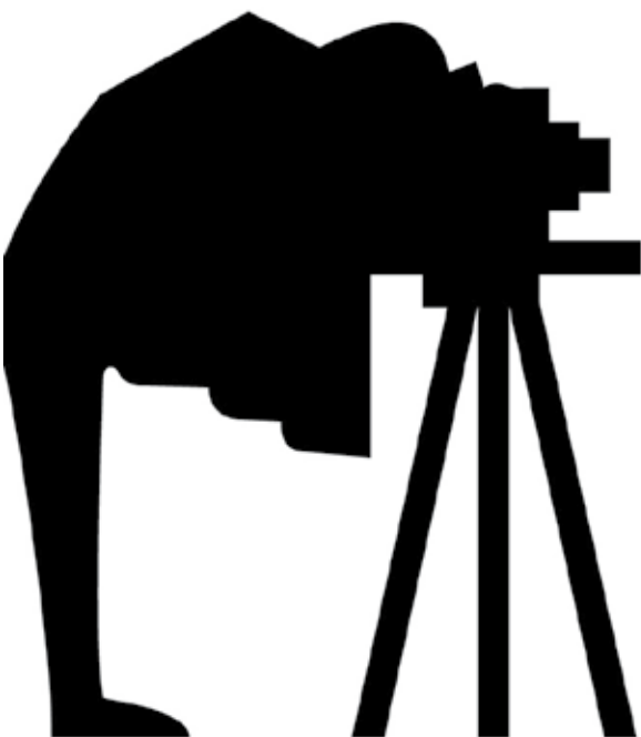
Photo sessions scheduled Now through Oct. 4th