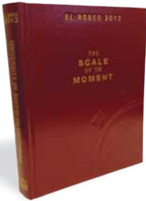
Photo sessions scheduled Now through Dec. 7th