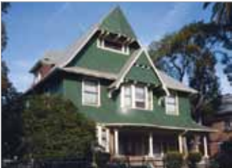
WOODCRAFT MANOR 9 Bedrooms - $7,500/month