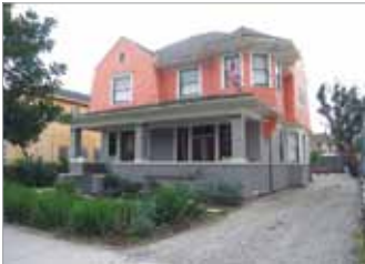
ARABELLA'S HOUSE 6 Bedrooms - $5,500/month