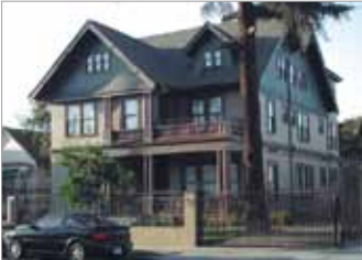
GRIFFITH HALL Shared Apts - $850/month/room