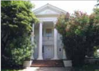
THE COLONEL'S MANSION Rooms for $800 and $850/month

LARGE ROOMS, FREE PARKING, WEEKLY HOUSEKEEPING NOW SHOWING FOR AUGUST 2014 (213) 663-3023 – www.RobinsonResidences.com (2-4)