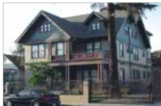
GRIFFITH HALL Shared Apts - $850/month/room