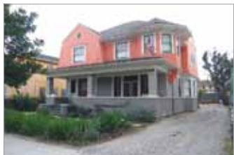
ARABELLA'S HOUSE 6 Bedrooms - $5,500/month