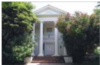
THE COLONEL'S MANSION Rooms for $800 and $850/month

LARGE ROOMS, FREE PARKING, WEEKLY HOUSEKEEPING NOW SHOWING FOR AUGUST 2014 (213) 663-3023 - www.RobinsonResidences.com (1-28)