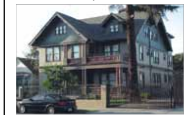
GRIFFITH HALL Twin-studio Apts - $850/month/room