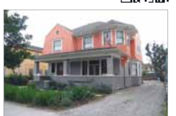
ARABELLA'S HOUSE 6 Bedrooms - $5,500/month