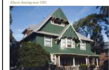
WOODCRAFT MANOR Private rooms from $800/month