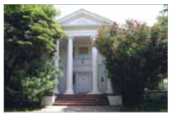
THE COLONEL'S MANSION One room left - $800/month

LARGE ROOMS, FREE PARKING, WEEKLY HOUSEKEEPING NOW SHOWING FOR AUGUST 2014 (213) 663-3023 - www.RobinsonResidences.com (4-2)