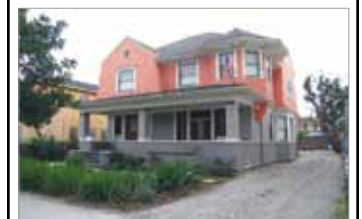
ARABELLA'S HOUSE 6 Bedrooms - $5,500/month