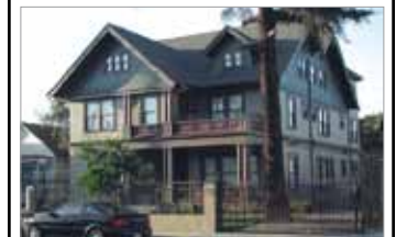
GRIFFITH HALL Twin-studio Apts - $850/month/room

LARGE ROOMS, FREE PARKING, WEEKLY HOUSEKEEPING NOW SHOWING FOR AUGUST 2014