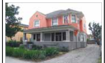
ARABELLA'S HOUSE 6 Bedrooms - $5,500/month