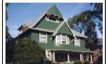
WOODCRAFT MANOR Private rooms from $800/month