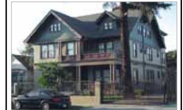
GRIFFITH HALL Twin-studio Apts - $850/month/room

LARGE ROOMS, FREE PARKING, WEEKLY HOUSEKEEPING NOW SHOWING FOR AUGUST 2014 (213) 663-3023 www.RobinsonResidences.com