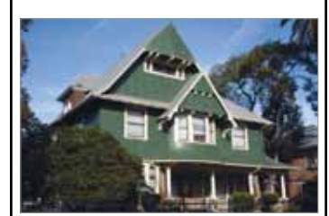
WOODCRAFT MANOR Private rooms from $850/month