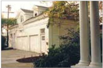
THE CARRIAGE HOUSE Unique 2 Bdrm Apt - $2,000/month

LARGE ROOMS, FREE PARKING, WEEKLY HOUSEKEEPING NOW SHOWING FOR AUGUST 2015 (213) 663-3023 – www.RobinsonResidences.com