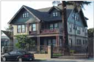
GRIFFITH HALL Shared Apts - $875/room/month