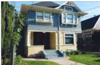
WESTON HOUSE Graduates Only - $900/month

LARGE ROOMS, FREE PARKING, WEEKLY HOUSEKEEPING NOW SHOWING FOR AUGUST 2015 (213) 663-3023 www.RobinsonResidences.com