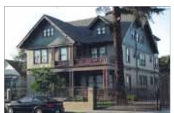
GRIFFITH HALL Room, Studio and 2 Room Apt.

LARGE ROOMS, FREE PARKING, WEEKLY HOUSEKEEPING NOW SHOWING FOR AUGUST 2016 (213) 663-3023 - www.RobinsonResidences.com (3-10)