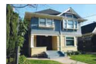
WESTON HOUSE 6 Bedrooms - $5,500/month