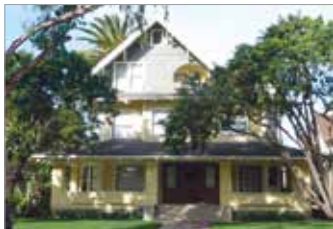
WALLACE HOUSE 7 Bedrooms - $7,000/month