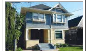
WESTON HOUSE 6 Bedrooms - $7,000/month

LARGE ROOMS, FREE PARKING, WEEKLY HOUSEKEEPING NOW SHOWING FOR AUGUST 2019 (213) 663-3023 www.RobinsonResidences.com