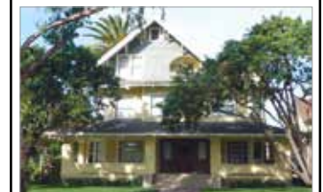
WALLACE HOUSE 7 Bedrooms - $7,000/month