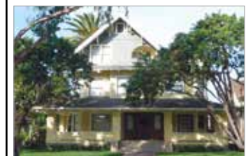
WALLACE HOUSE 7 Bedrooms - $7,000/month