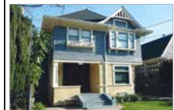
WESTON HOUSE 6 Bedrooms - $7,000/month

LARGE ROOMS, FREE PARKING, WEEKLY HOUSEKEEPING NOW SHOWING FOR AUGUST 2019 (213) 663-3023 www.RobinsonResidences.com