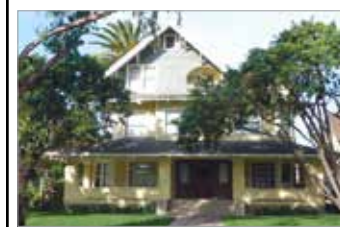
WALLACE HOUSE 7 Bedrooms - $7,000/month