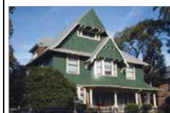
WOODCRAFT MANOR 9 Bedrooms - $9,000/month