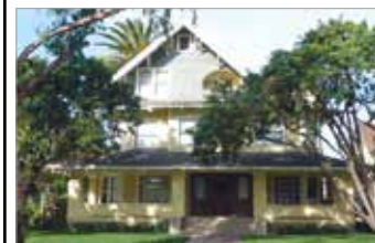
WALLACE HOUSE 7 Bedrooms - $7,000/month