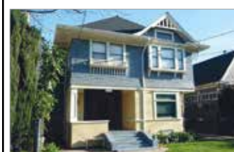
WESTON HOUSE 6 Bedrooms - $7,000/month

LARGE ROOMS, FREE PARKING, WEEKLY HOUSEKEEPING NOW SHOWING FOR AUGUST 2019 (213) 663-3023 www.RobinsonResidences.com