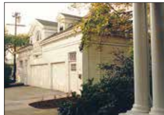
THE CARRIAGE HOUSE 23 St. James Park Unique 2 Bdrm Apt - $2,300/month

LARGE ROOMS, FREE PARKING, WEEKLY HOUSEKEEPING NOW SHOWING FOR AUGUST 2020 (213) 663-3023 www.RobinsonResidences.com