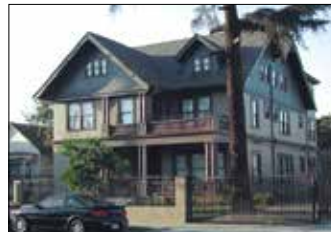
GRIFFITH HALL 939 West 21st Street Twin-studio Apts - $2,000/month