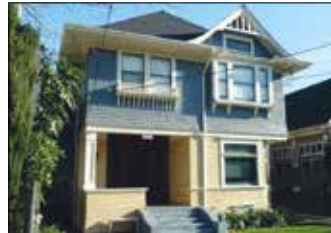
WESTON HOUSE 2112 Portland Street 6 Bedrooms - $7,000/month