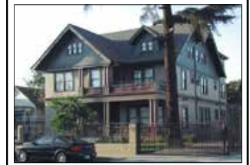
GRIFFITH HALL 939 West 21st Street Twin-studio Apts - $2,000/month