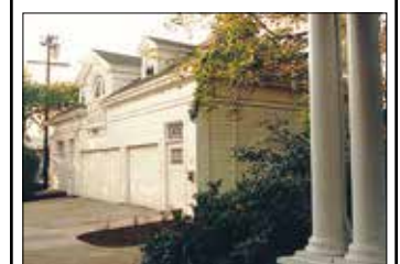
THE CARRIAGE HOUSE 23 St. James Park Unique 2 Bdrm Apt - $2,300/month

LARGE ROOMS, FREE PARKING, WEEKLY HOUSEKEEPING NOW SHOWING FOR AUGUST 2020 (213) 663-3023 www.RobinsonResidences.com