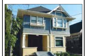
WESTON HOUSE 2112 Portland Street 6 Bedrooms - $7,000/month