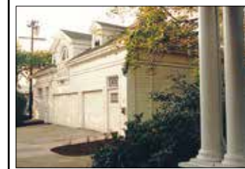
THE CARRIAGE HOUSE 23 St. James Park Unique 2 Bdrm Apt - $2,300/month

LARGE ROOMS, FREE PARKING, WEEKLY HOUSEKEEPING NOW SHOWING FOR AUGUST 2020 (213) 663-3023 www.RobinsonResidences.com