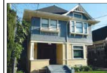
WESTON HOUSE 2112 Portland Street 6 Bedrooms - $7,000/month