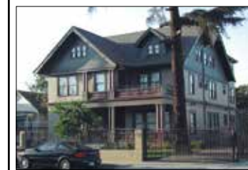
GRIFFITH HALL 939 West 21st Street Twin-studio Apts - $2,000/month