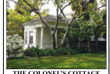
THE COLONEL'S COTTAGE 23 St. James Park 1 Bdrm Dollhouse - $1,600/month

LARGE ROOMS, FREE PARKING, WEEKLY HOUSEKEEPING NOW SHOWING FOR AUGUST 2020 (213) 663-3023 www.RobinsonResidences.com