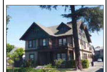
GRIFFITH HALL 939 West 21st Street Twin-studio Apt - $2,000/month