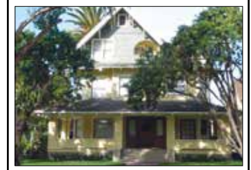
WALLACE HOUSE 2367 Scarff Street 3 Bdrm Flat - $3,000/month