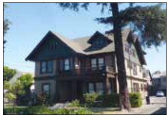
GRIFFITH HALL 939 West 21st Street 1 room available - $950/month