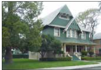
WOODCRAFT MANOR 2111 Park Grove Avenue Private rooms for grads only - $875 LARGE ROOMS, FREE PARKING, WEEKLY HOUSEKEEPING

(213) 663-3023 www.RobinsonResidences.com