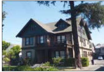
GRIFFITH HALL 939 West 21st Street Rooms available - $900/month