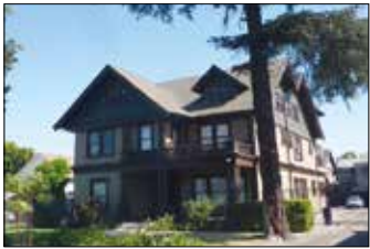
GRIFFITH HALL 939 West 21st Street Rooms available - $900/month