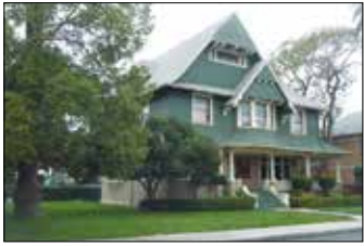
WOODCRAFT MANOR 2111 Park Grove Avenue Private room for grads only - $900

LARGE ROOMS, FREE PARKING, WEEKLY HOUSEKEEPING