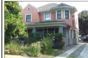
ARABELLA'S HOUSE 2120 Oak Street 6 Bedrooms - $7,000/month

ROBINSON RESIDENCES RENTING NOW FOR FALL 2021: THE FINEST HOUSES IN UNIVERSITY PARK