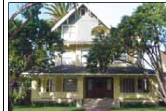
WALLACE HOUSE 2365 Scarff Street 7 Bedrooms - $7,000/month