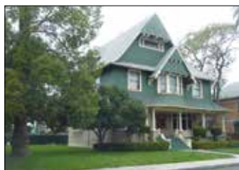
WOODCRAFT MANOR 2111 Park Grove Avenue Private rooms, grads only - from $925

ALL OUR HISTORIC HOUSES ARE NORTH OF CAMPUS IN USC'S PUBLIC SAFETY ZONE