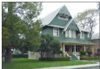
WOODCRAFT MANOR 2111 Park Grove Avenue Private rooms, grads only - from $925

ALL OUR HISTORIC HOUSES ARE NORTH OF CAMPUS IN USC'S PUBLIC SAFETY ZONE