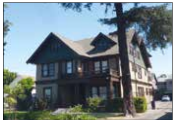
GRIFFITH HALL 939 West 21st Street Private rooms - $1,000/month