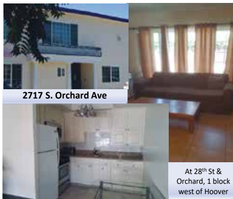
2717 S. Orchard Ave

We are a family-owned apartment community that specializes in catering to students.