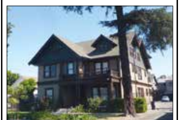
GRIFFITH HALL 939 West 21st Street Twin Studios - $2,100/month

ALL OUR HISTORIC HOUSES ARE NORTH OF CAMPUS IN USC'S PUBLIC SAFETY ZONE