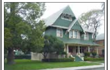
WOODCRAFT MANOR 2111 Park Grove Avenue 9 Bedrooms - $10,000/month

RENTING NOW FOR FALL 2022: THE FINEST HOUSES IN UNIVERSITY PARK