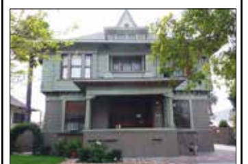
MONTGOMERY HOUSE 1010 West 21st Street 7 Bedrooms - $7,500/month