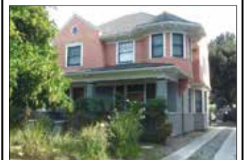
ARABELLA'S HOUSE 2120 Oak Street 6 Bedrooms - $7,000/month