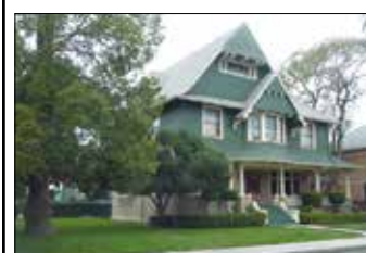
WOODCRAFT MANOR 2111 Park Grove Avenue 9 Bedrooms - $10,000/month

RENTING NOW FOR FALL 2022: THE FINEST HOUSES IN UNIVERSITY PARK