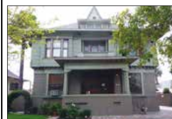
MONTGOMERY HOUSE 1010 West 21st Street 7 Bedrooms - $7,500/month