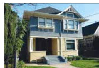
WESTON HOUSE 2112 Portland Street 6 Bedrooms - $7,000/month