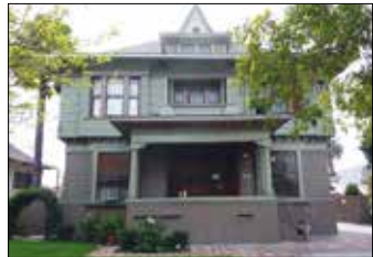
MONTGOMERY HOUSE 1010 West 21st Street 7 Bedrooms - $7,500/month