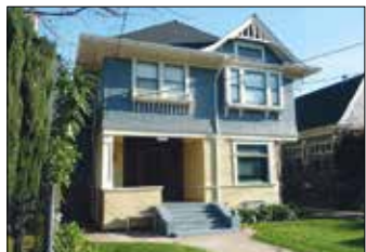
WESTON HOUSE 2112 Portland Street 6 Bedrooms - $7,000/month