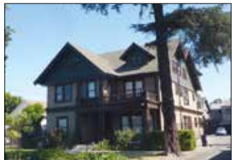
GRIFFITH HALL 939 West 21st Street Twin Studios - $2,100/month

ALL OUR HISTORIC HOUSES ARE NORTH OF CAMPUS IN USC'S PUBLIC SAFETY ZONE