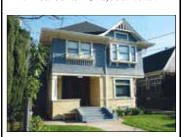
WESTON HOUSE 2112 Portland Street 6 Bedrooms - $7,000/month