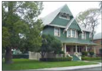
WOODCRAFT MANOR 2111 Park Grove Avenue 9 Bedrooms - $10,000/month

RENTING NOW FOR FALL 2022: THE FINEST HOUSES IN UNIVERSITY PARK