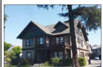
GRIFFITH HALL 939 West 21st Street Twin Studios - $2,100/month

ALL OUR HISTORIC HOUSES ARE NORTH OF CAMPUS IN USC'S PUBLIC SAFETY ZONE Details, photos, floor plans on www.RobinsonResidences.com Call/text (213) 663-3023