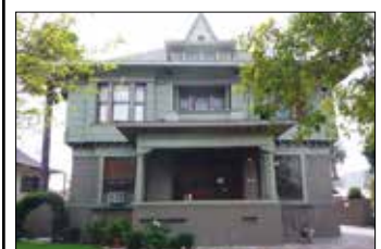
MONTGOMERY HOUSE 1010 West 21st Street 7 Bedrooms - $7,500/month