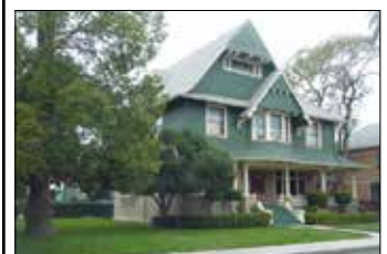
WOODCRAFT MANOR 2111 Park Grove Avenue 9 Bedrooms - $10,000/month

RENTING NOW FOR FALL 2022: THE FINEST HOUSES IN UNIVERSITY PARK