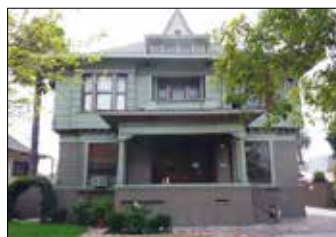
MONTGOMERY HOUSE 1010 West 21st Street 7 Bedrooms - $7,500/month