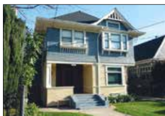
WESTON HOUSE 2112 Portland Street 6 Bedrooms - $7,000/month