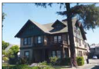
GRIFFITH HALL 939 West 21st Street Twin Studios - $2,100/month

ALL OUR HISTORIC HOUSES ARE NORTH OF CAMPUS IN USC'S PUBLIC SAFETY ZONE