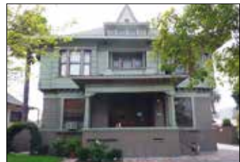
MONTGOMERY HOUSE 1010 West 21st Street 7 Bedrooms - $7,500/month