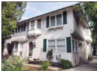
PARK VILLA 663 West 23rd Street Graduate Students Only Rooms from $1,100/month

ALL OUR HISTORIC HOUSES ARE NORTH OF CAMPUS IN USC'S PUBLIC SAFETY ZONE