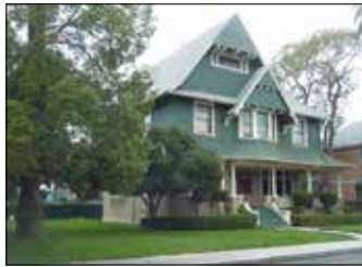
WOODCRAFT MANOR 2111 Park Grove Avenue 9 Bedrooms - $10,000/month