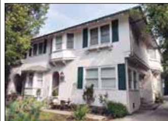
PARK VILLA 663 West 23rd Street Graduate Students Only Rooms from $1,100/month

ALL OUR HISTORIC HOUSES ARE NORTH OF CAMPUS IN USC'S PUBLIC SAFETY ZONE