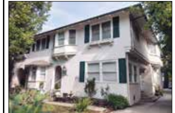
PARK VILLA 663 West 23rd Street Graduate Students Only Rooms from $1,100/month

ALL OUR HISTORIC HOUSES ARE NORTH OF CAMPUS IN USC'S PUBLIC SAFETY ZONE Details, photos, floor plans on www.RobinsonResidences.com Call/text (213) 663-3023